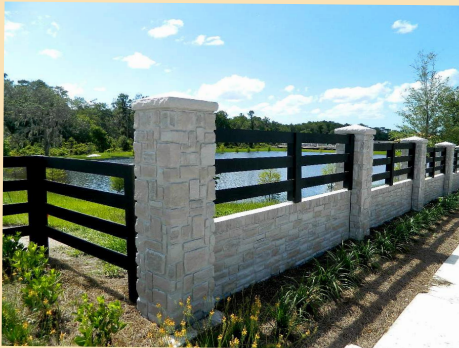
TOP: DURANGO BOTTOM: ASHLAR COLUMNS WITH LEDGE STONE PANELS